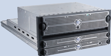
Dell/EMC CX3-40c Dell/EMC CX3-40f