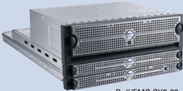
Dell/EMC CX3-20c Dell/EMC CX3-20f