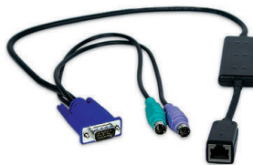
Dell PS/2 Server Interface Pod (SIP)