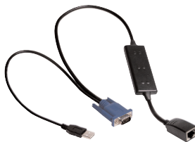
Dell USB Server Interface Pod (SIP)