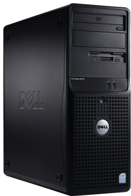
Dell PowerEdge SC440

The PowerEdge SC440 is designed to give small businesses the flexibility necessary to stay competitive. With 50% more SATA storage capacity and higher performance networking slots than the previous generation Dell server, the SC440 can scale with the growing needs of the business. Its memory, I/O technology, and storage capacity make the PowerEdge SC440 an ideal option for small businesses with five to ten clients that require high uptime for dedicated applications, file/print utilization, messaging, and shared Internet access.