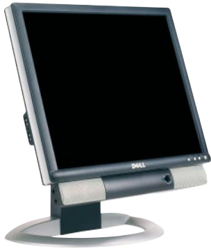
1704FPT with AS500 sound bar