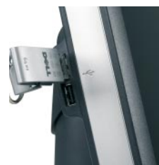
Close-up of USB port